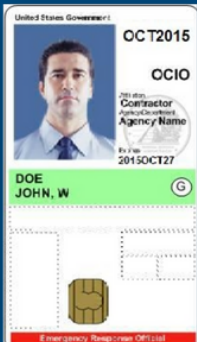
Example Contractor CAC

Due to operational laxness at many hotels across the country, many contractors expect to receive a Per Diem rate despite not technically qualifying for one. Rather than turn away potentially lucrative business, consider offering a government contractor rate at a dynamic discount, or somewhat competitive with Per Diem